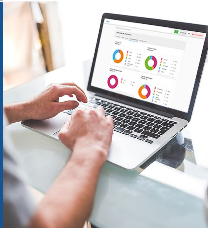
Actual screen capture

It's been a few months since the initial release of the mobile application and TopDevz' team of senior software engineers are working on added features like a video conferencing system for virtual encounters. So far, not only did the application fulfil its primary objective of adding value to events registration packages and increasing participants' engagement, it also created new marketing and revenue opportunities for the event organizer through user data collection and in-app advertising.