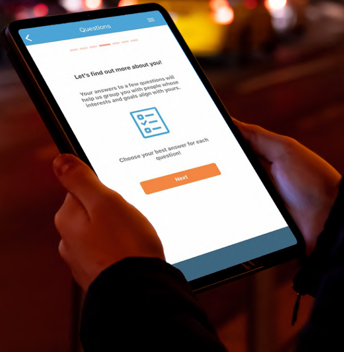
Actual screen capture

To collect the attendees' interests and pair them with relevant contacts, TopDevz created a multi-platform solution: a Progressive Web App built using NodeJs, VueJS and Amazon's DynamoDB and a React Native mobile app. Project managers can create events on the backend and include a series of questions used by the platform's algorithm for people matching. Once matched, attendees are located using their mobile device's GPS and receive a push notification instructing them where to meet their group. The app also gives them information on the people in their group and possible icebreakers.