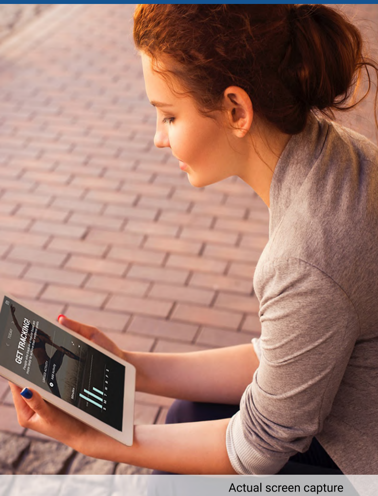
Actual screen capture

Looking for a new and creative way to engage its customers, the broker reached out to TopDevz' custom software development team to create a performance-based wellness mobile app to complement their online health management application. Other than integrating with its current platform, the iOS and Android app needed to integrate with medical devices, mobile devices' current health applications, and increasingly popular health data and activity trackers.