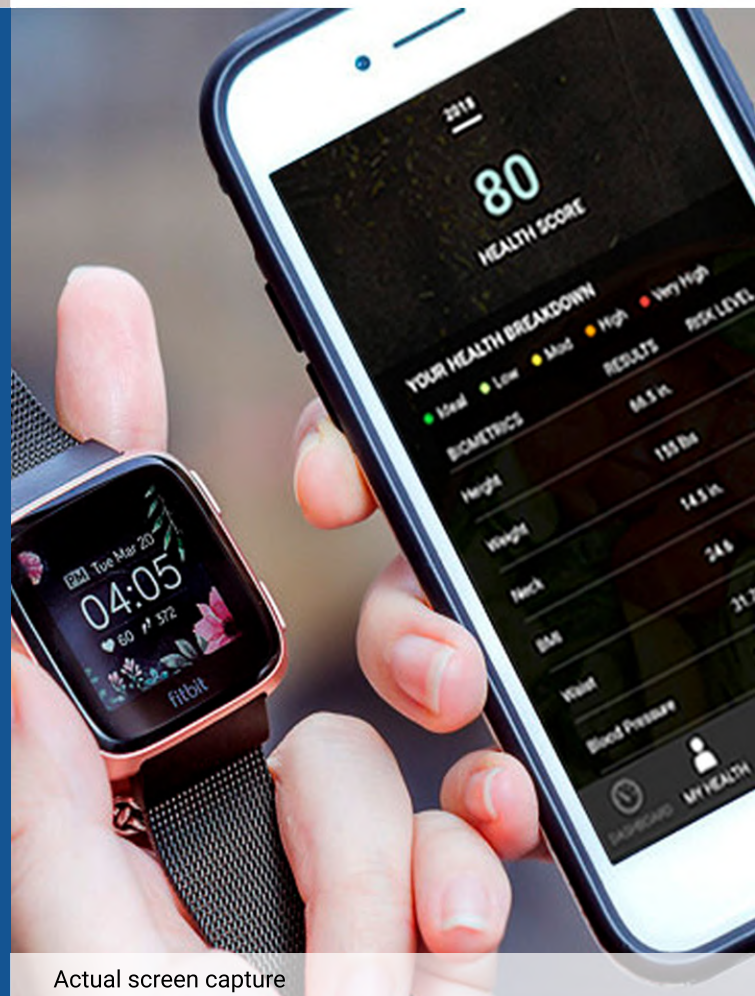
Actual screen capture

The mobile app was advertised through the company's network of insurance providers and deployed to more than 30,000 employees on day one. The platform achieved its goal of user engagement and after the initial launch, TopDevz' mobile engineers worked on the second version of the app and added features such as appointment booking and gamification. TopDevz is still currently involved in the maintenance of the app, and the broker reckons that "TopDevz' team has been a true partner and has gone above and beyond our expectations".