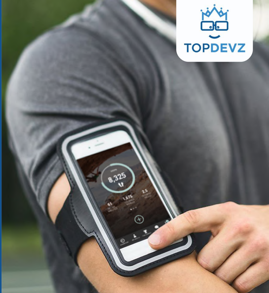
Actual screen capture

With over 125 years of existence, this American company is one of the United States largest insurance brokers and provides a full suite of risk management and employee benefits services. Strongly committed to providing superior service to its clients, the insurer is always looking for innovative solutions to add value to its lines of products.